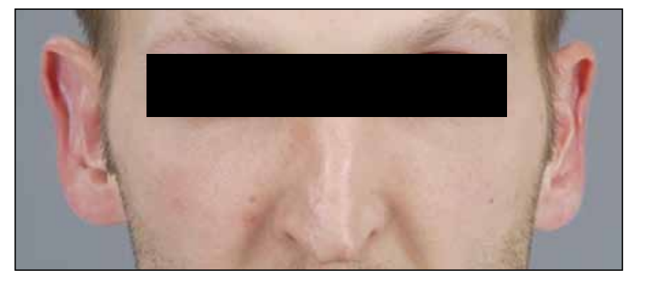
Figure 2 Aggressive cutting or scoring otoplasty techniques bury the risk of asymmetry and undesired edges or creases, which are difficult to correct and often cause an appearance which is more annoying than the preoperative state of protruding ears

Another method to flatten a protruding concha cavum is via cavum rotation (or conchal setback). This technique uses concha-mastoid sutures, thus bringing the antihelix edge closer to the skull. These sutures were described at the beginning of the 20th century by Morestin<sup>27</sup> and Goldstein<sup>20</sup>, and popularised by David W. Furnas since 1968<sup>29</sup>. Caution must be taken not to confine the external auditory canal.